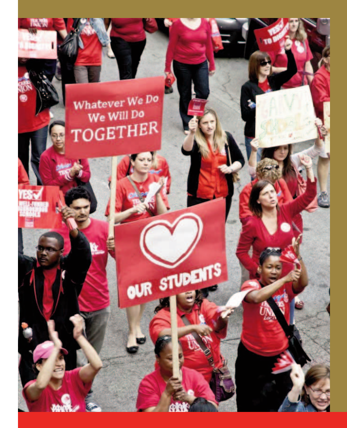
Mass march by Chicago Teachers Union, August 2012.

(5) Not least, a substantial investment in high-quality teachers who are specialists in their fields (especially in science and math). This will require a substantial increase in salaries across the board (instead of the cuts we are now seeing), far beyond anything envisaged in the paltry and divisive plans for "merit pay" now being proposed.