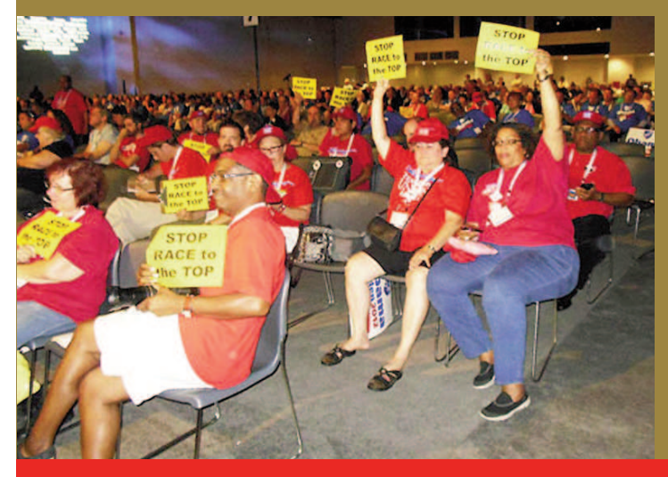
Chicago Teachers Union delegates to the AFT convention (above) refused to wear blue "Obama Biden" teeshirts that were being given away to delegates or hoist the "Obama Biden" signs during a July 29 speech by Vice President Joseph Biden, instead wearing Chicago's distinctive red teeshirts and silently holding up signs reading "Stop Race To The Top."

The crisis in the United States public school system is one part of the decay of the entire infrastructure of the country. Whether