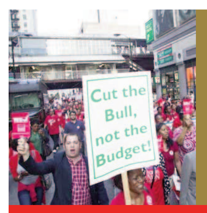
Chicago Teachers Union rally, August 2012.

Flowing from their mistaken and self-serving assumption that the problem with the schools is the teachers, Obama's RttT weakens teacher unions and to opens the door for privatization of the public schools. Among other things, RttT lifts the caps on charter school openings, ushering in a massive increase in private charter schools. Privatization removes virtually all public control over the schools by putting taxpayer money into the hands of private school corporations and foundations. Accountability goes to the owners who expect to make profits. Over time, charter schools will become an increasing financial drain on public resources, costing taxpayers more than public schools but making no improvement in the education of children.