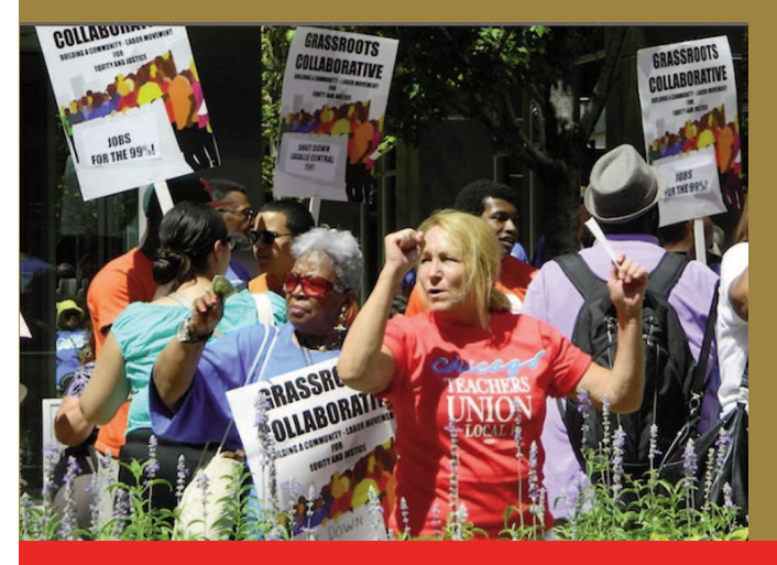
Union teachers and community members demanded TIF taxpayer money go to schools and parks, not multi-million-dollar downtown developments, at a restaurant-themed protest.

In Chicago, the closing and privatization of public schools and health clinics, a drastic reduction in funds for education and public libraries, and major cuts in other social services, including severe cutbacks in Medicaid affecting 2.7 million people in the state, have set the stage for a confrontation between Chicago's political establishment and its teachers. The city's continued allocation of public money to private charter schools and luxury establishments while refusing to finance basic needs for public school children reflects its real priorities. The recent allocation of $29.5 million in TIF money to the River Point Plaza in downtown Chicago is just one example. TIF (tax increment financing) money uses millions of taxpayer dollars to finance projects to benefit private developers rather than using resources to support public schools, parks, and health clinics. The mayor's proposed $5.6 billion school budget allocates $76 million to private charter operators while simultaneously draining Chicago Public Schools' (CPS) reserves down to zero, which downgraded the CPS bond rating. The money Chicago allocates to charters has escalated in recent years from $30 million in 2002 to their current plan of $500 million (half a billion) in 2012. Emanuel's recent revelation that he has set aside $25 million for strike preparations makes clear that he can get his hands on significant funds when he wants to but chooses not to put it into the school system.