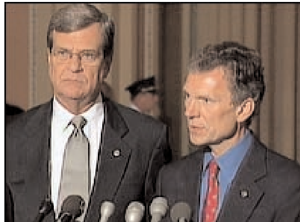
These were protected: Senators Trent Lott (left) and Tom Daschle.