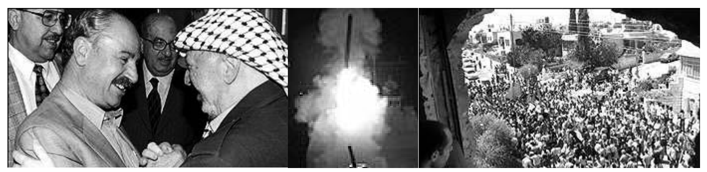
Mustafa Al-Zibri with Yasir Arafat (left); US cruise missile (center); looking out from ruined PFLP office (right)

This home truth isn't very fashionable now in the U.S. Learned commentators tell us that Osama bin Laden hates all Western civilization, not just Israel or U.S. support for