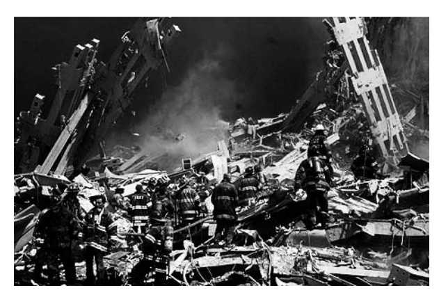
Firefighters on Sept. 11 (top); crossing Brooklyn Bridge (bottom)

We Leftists and revolutionaries can put this monstrous evil in the context of worldwide suffering. But we must not harden our hearts to the suffering and pain of so many right now in New York. We must not let abstractions of "class" and "imperialism" get in the way of a human response. We are right, but should not fall into self-righteousness. The desire of working people to help each other and support each other in a time of crisis has been wonderful, and we should be part of that. Meanwhile we must do all we can to oppose the tide of nationalist hatred and especially to defend Arabs and Muslims in the U.S. from attacks. We must be prepared to oppose the coming U.S. war.