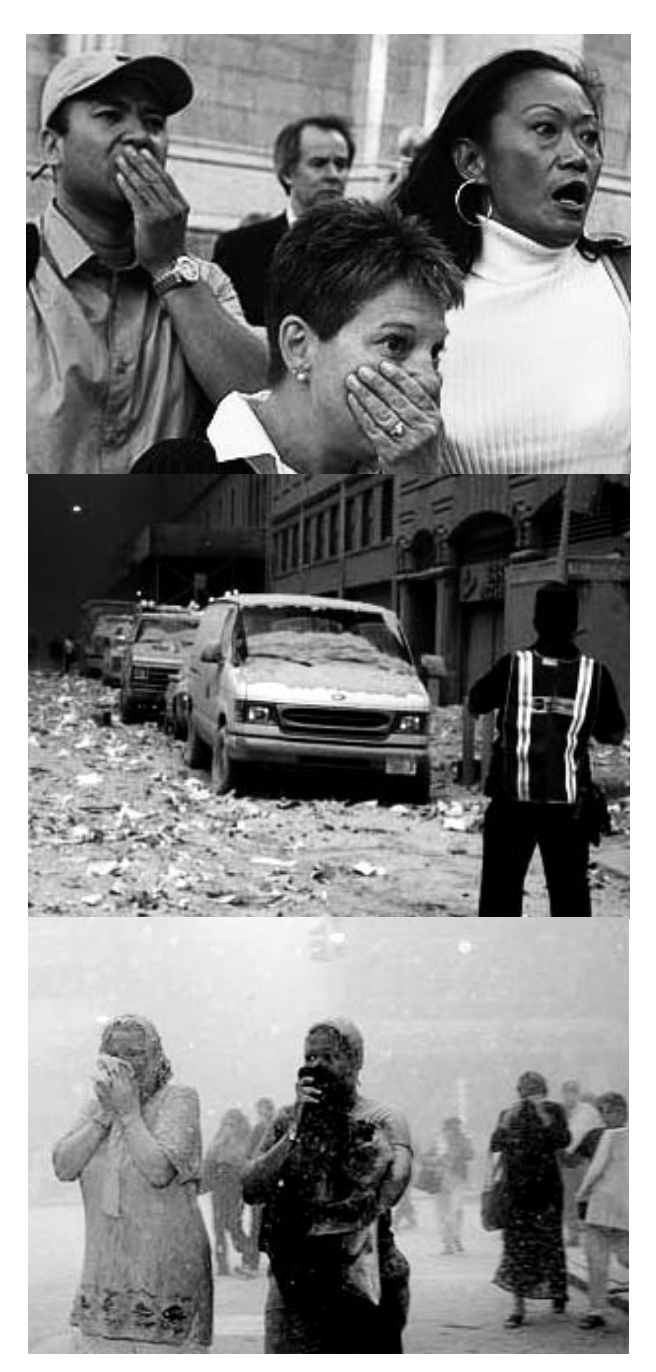
Watching the towers collapse (top); at "ground zero" (center, bottom).

themselves may become victims. Further, working and oppressed people are our class brothers and sisters, even if they may be divided from us by adherence to the oppressor's ideology. We do not attack them, or we do so to the smallest extent possible (for example, it is legitimate to attack an occupying army).