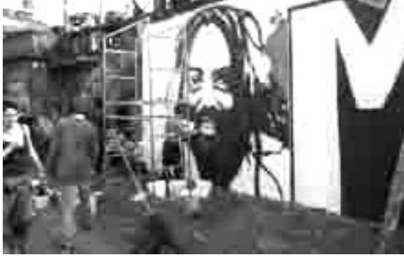
International rally to defend Mumia, Italy, 2000

Circuit Court, and the refusal to allow even a deposition of Arnold Beverly amount to such a conspiracy.